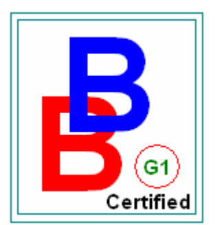
Figure 3 – Broadband certification

In an effort to indentify the speed and QoS with "Broadband", the "Broadband" service providers should get a certification (see Figure 3) from NTA based on customer's "Bandwidth" subscription verification. Services that do not comply with "Broadband" minimum requirement cannot be packaged or promoted as "Broadband" service.